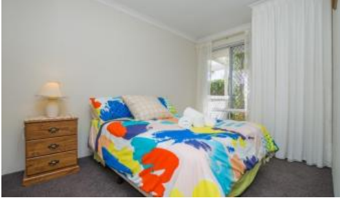
🔚 3 🔊 1 🗐 1

We will carefully prune, weed and clear pathways and garden. Naturally removing any garden pest or fungicides without the use of poisons. Repair blocked or damaged sprinklers, keeping your garden watered. And Add our compost building program for a healthy water wise garden and replacing any