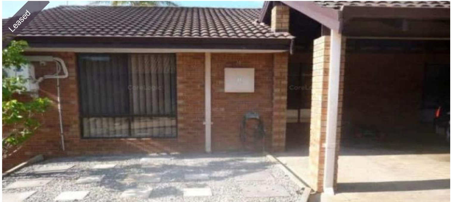
Unit 7, 139 Waterloo St, Tuart Hill