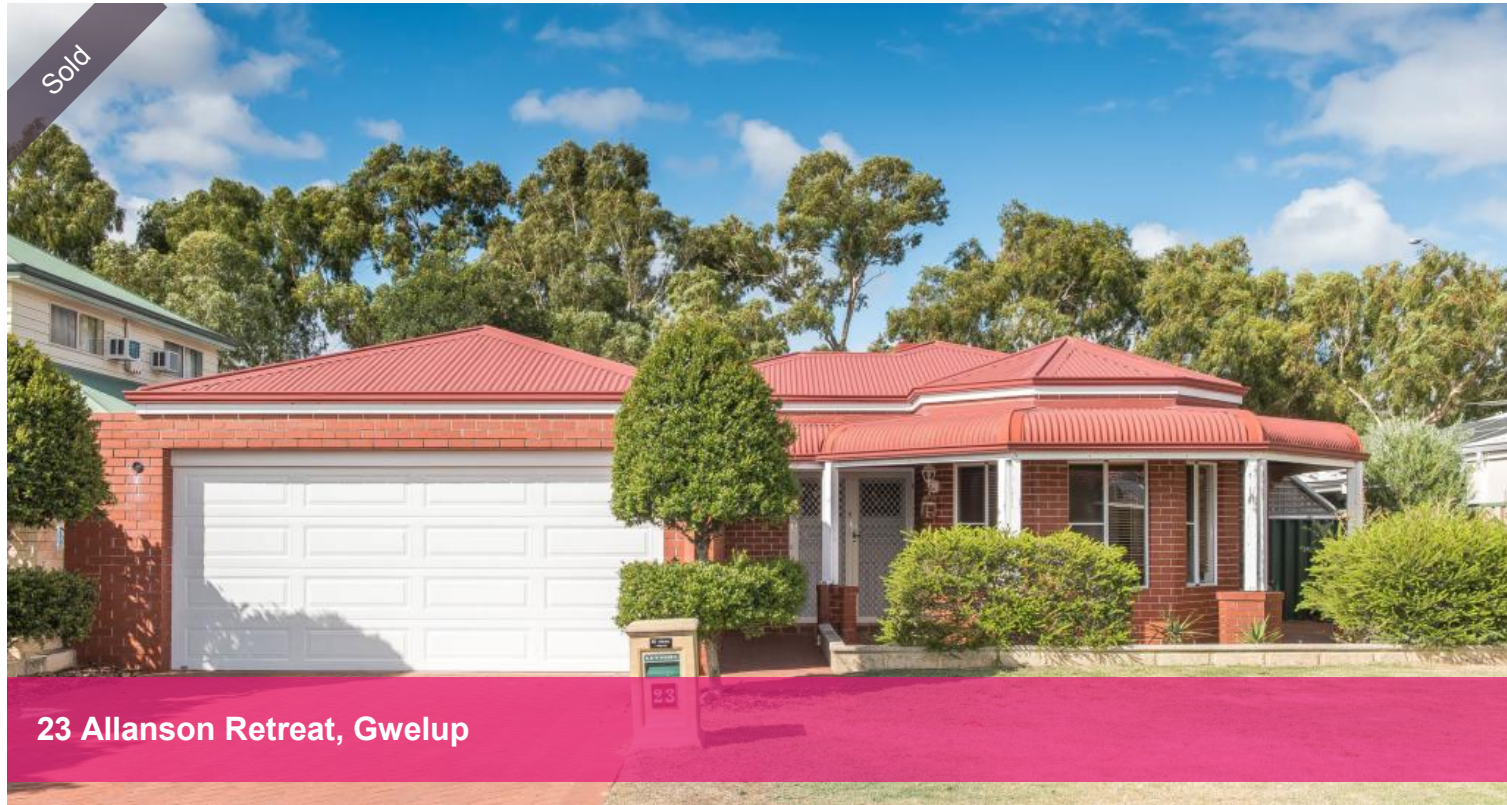
23 Allanson Retreat, Gwelup