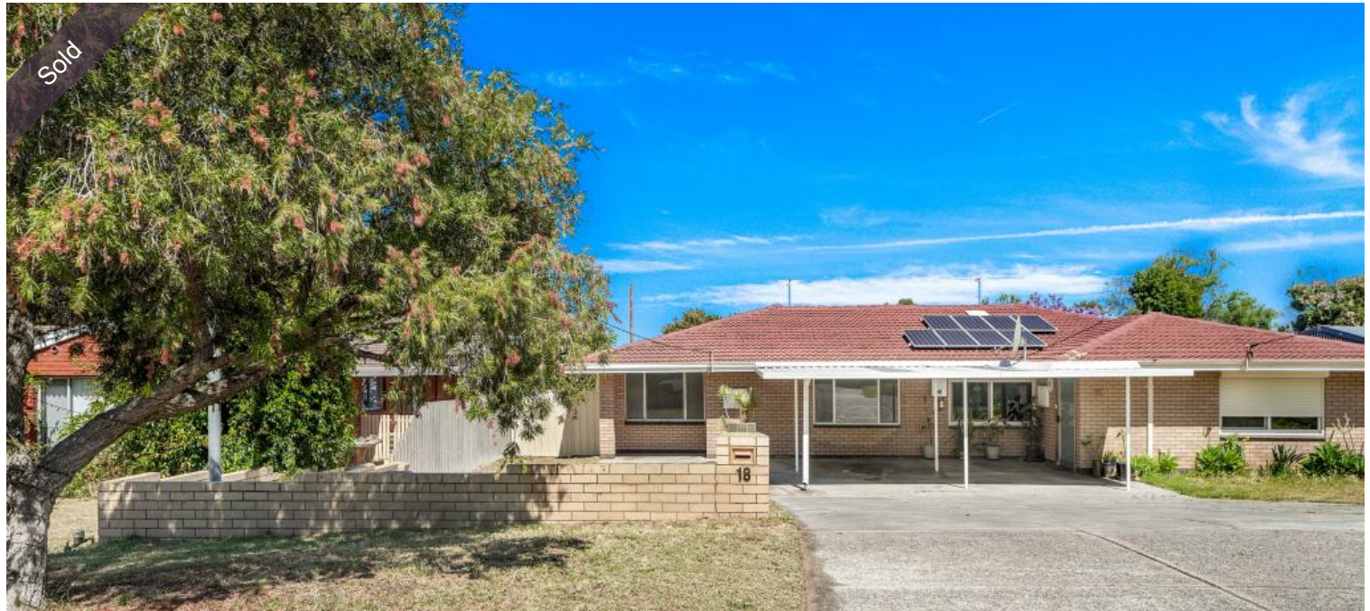
18 Sharon Drive, Carine