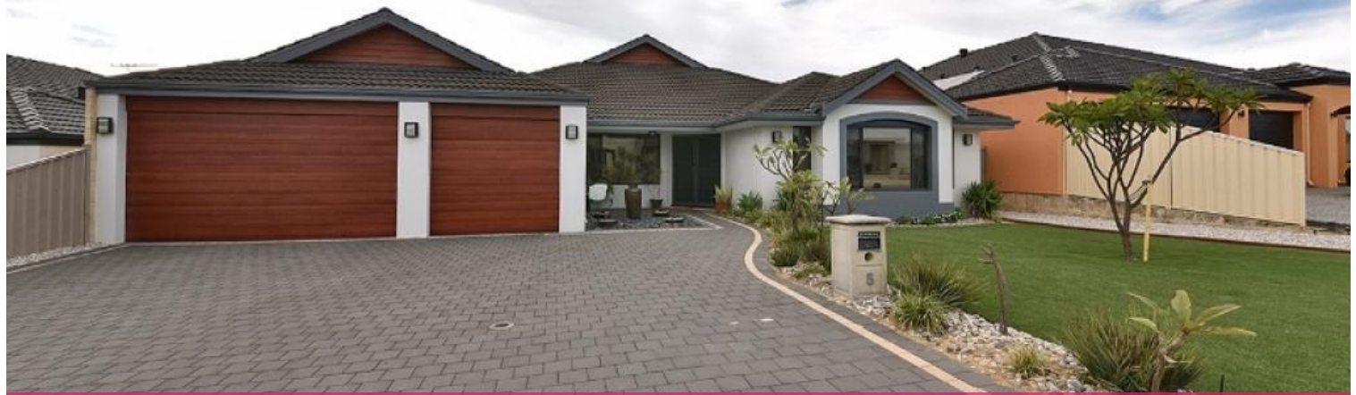
5 Hopewell Pass, Carramar