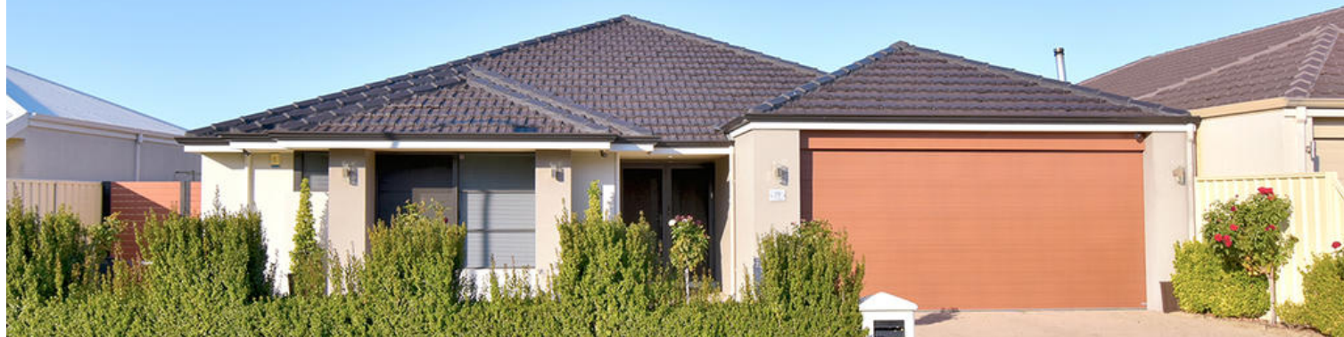
19 Karst Elbow, Alexander Heights