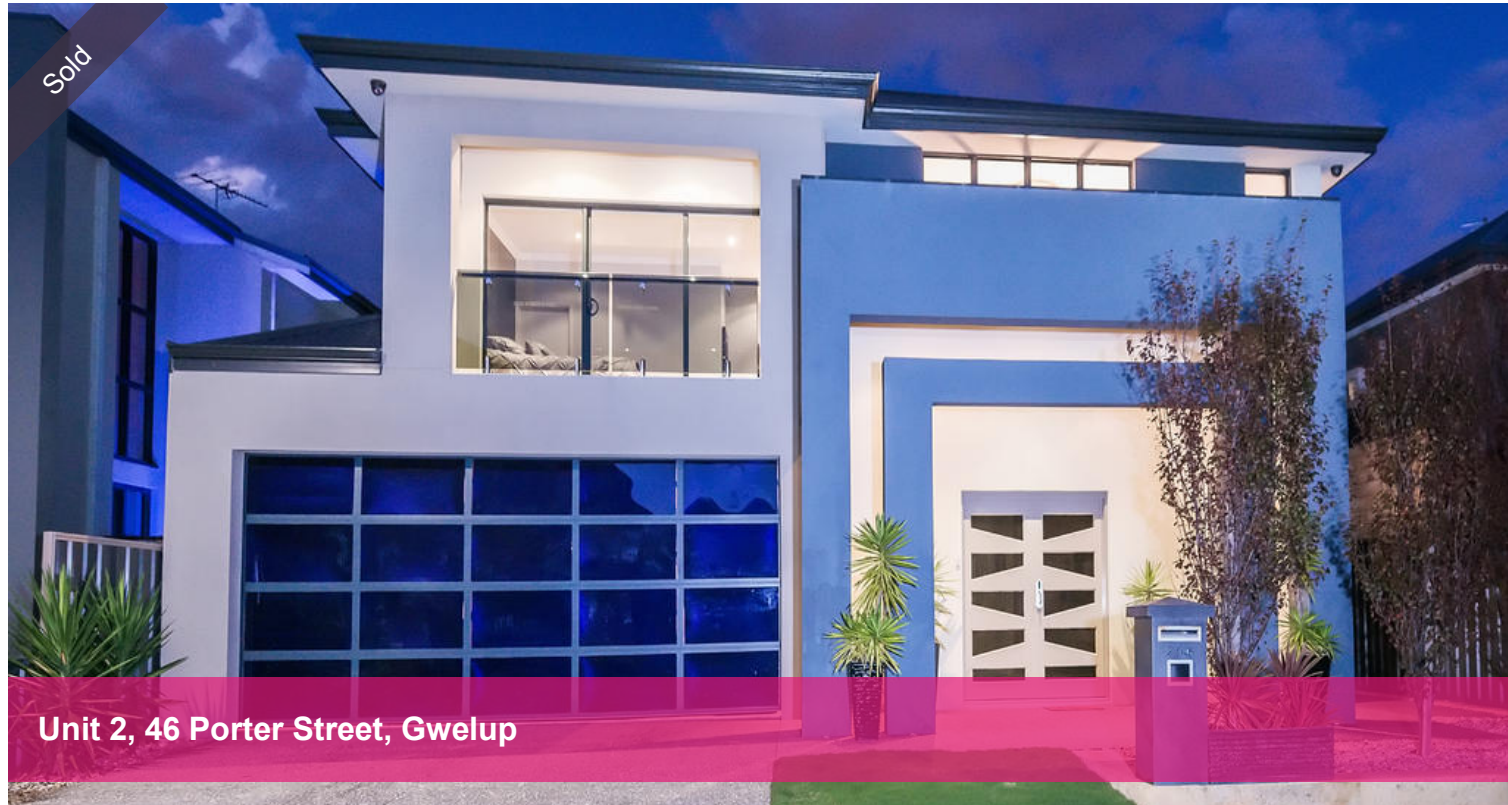
Unit 2, 46 Porter Street, Gwelup